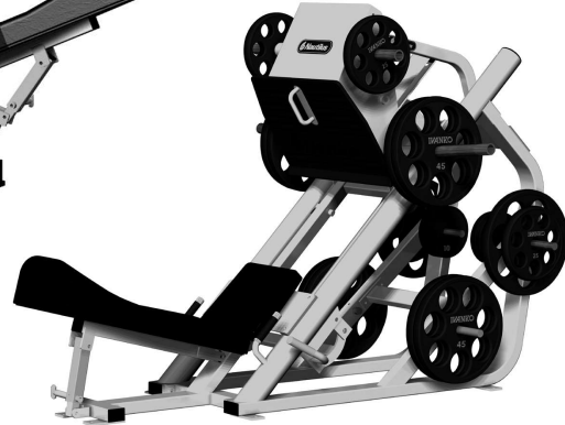
INCLINE LEG PRESS