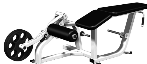
LEG CURL PRONE