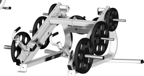
DEAD LIFT / SHRUG